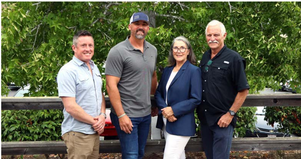
Foundation Board Leadership